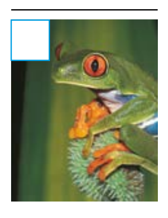
2. Do you know about these animals? Which ones are dangerous? Why?