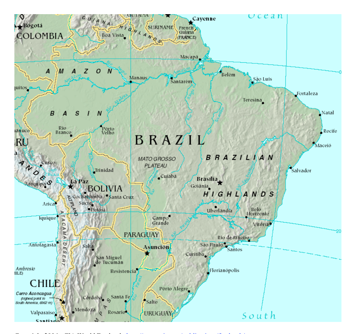
Copyright 2004. CIA World Factbook, <a href="http://www.cia.gov/publications/factbook/">http://www.cia.gov/publications/factbook/</a>