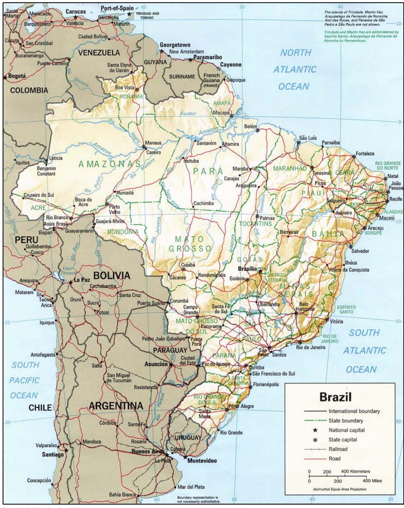
CIA World Factbook, 1994.